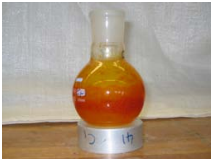
Figure 3: Waste flower extract from 2006 drying trial illustrating the bright red/orange colour of the extract product.