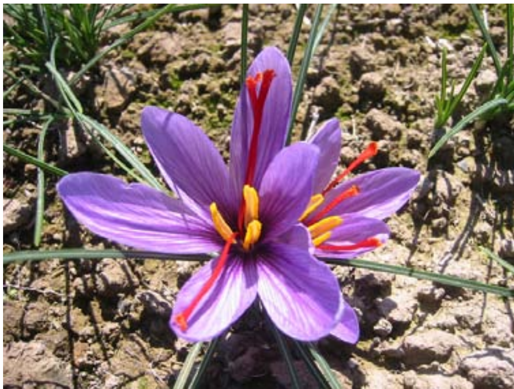
Figure 1: Close-up of fully open Crocus flower before picking showing red tripartite stigma, yellow stamens, lilac petals and narrow leaves.

The odourless, colourless and water soluble picricrocin, itself a glycoside, has been generally regarded as the main taste component, responsible for the bitter flavour of saffron(24;26). While the compound is certainly bitter and would contribute significantly to the taste, Carmona and Alonso(27) rightly highlight the lack of scientific evidence directly correlating picricrocin concentrations with degree of saffron bitterness and that significant levels of other compounds such as flavonoids would also contribute to this taste.